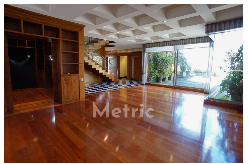
Code: 1714 Penthouse Triplex on 77th with 1st East